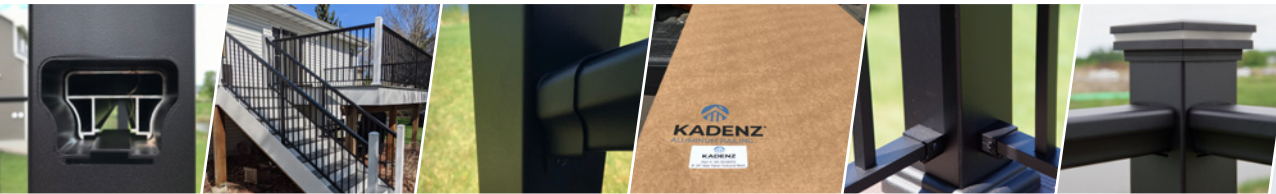
Internally Mounted Top Rail

We would rather build a product that is easier to install than a product that is easier to manufacture. We know that details matter. Performance matters. And most of all safety matters. Our first of its kind, internally mounted top rail provides unmatched strength, function, and beauty.