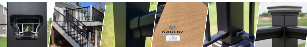
Internally Mounted Top Rail

We would rather build a product that is easier to install than a product that is easier to manufacture. We know that details matter. Performance matters. And most of all safety matters. Our first of its kind, internally mounted top rail provides unmatched strength, function, and beauty.