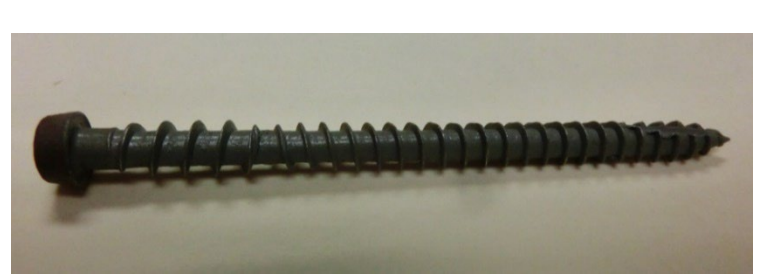
#10 2-3/4" Composite Deck Screw