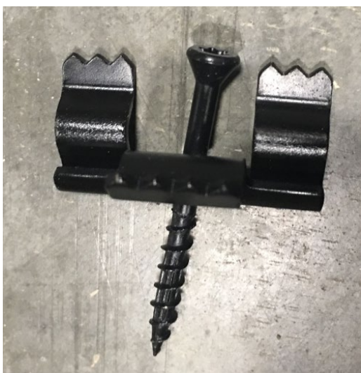
Optima Clip with 1-3/4" Screw

No duration of load increase is allowed for the uplift values noted in Table 1 in this Report.